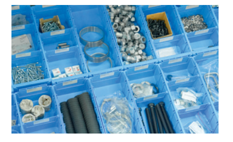
We help you to increase the profitability of your investments.

We help you in the sustainable conservation of value of your machines and plants.